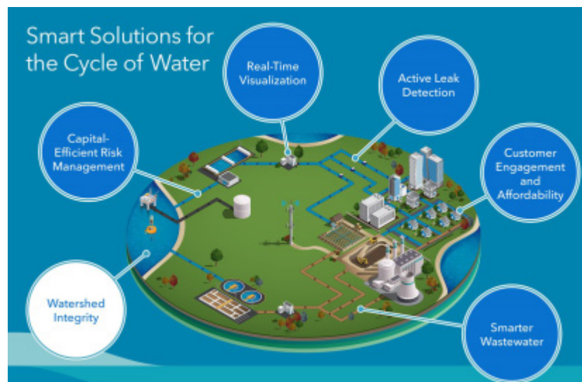
FIGURE 1. Advanced Infrastructure Analytics Platform of Xylem